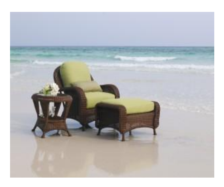
Summer Classics has an article called Patio Furniture and Your Pool which you can read <u>here</u>.

Outdoor space needs a different type of furniture to the indoors; furniture that can withstand the elements and depending where you live – that can mean a lot or very little. A well covered patio in an apartment block has a different <u>environment</u> to an outdoor space where there is a salt water pool ocean spray.